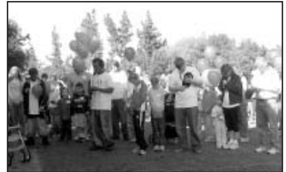
Walkers pray before the Walk begins (above)