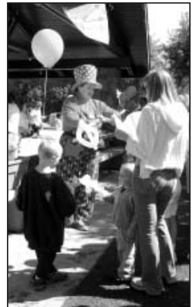
After the Walk there was lunch, games and lots of fun.